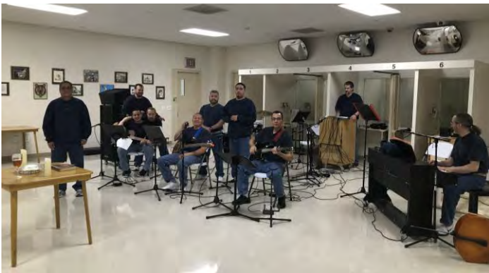
The Healing Room: Tuesday's @ 6PM in Visiting